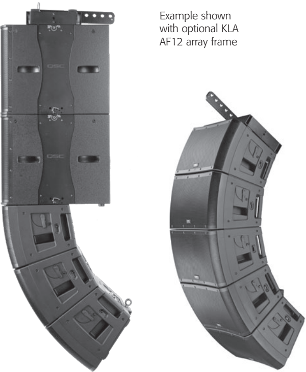
Example shown with optional KLA AF12 array frame

Up to five KLA enclosures (any combination of KLA12 and KLA181) can be flown via M10 fittings on the top of each enclosure. An optional KLA AF12 array frame is also available.