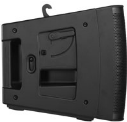
SOLO™ Rigging System

Housed in a rugged ABS enclosure that results in both light weight and long-term durability, the KLA12 features a 12-inch low-frequency transducer coupled with a 1.75-inch compression driver. Designed to be used exclusively as a fixed arcuate line array, each KLA12 is set at a 90° x 18° splay angle, allowing 90° vertical arrays to be configured using only five boxes (most other solutions require six). KLA's unique self-contained SOLO™ (Single-Operator Logistics) Rigging System enables users to quickly assemble (and disassemble) the line array in a fraction of the time without the need for special tools or external hardware.