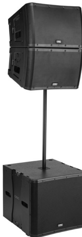
KLA181 shown with (2) KLA12

In addition to DEEP™ DSP algorithm, GuardRail™, Auto Standby, balanced line-level XLR input with an XLR "Thru" connector, Attenuation Control and LED indicators, the KLA181 subwoofer also includes a polarity switch for low-frequency directivity control.